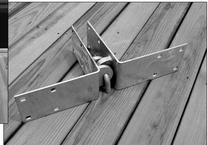
heavy-duty galvanized steel hardware