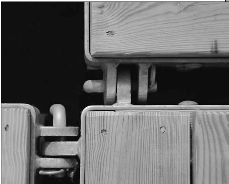
heavy-duty galvanized steel hardware installed