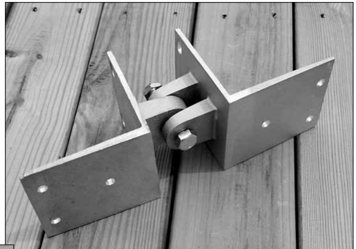
medium-duty aluminum hardware